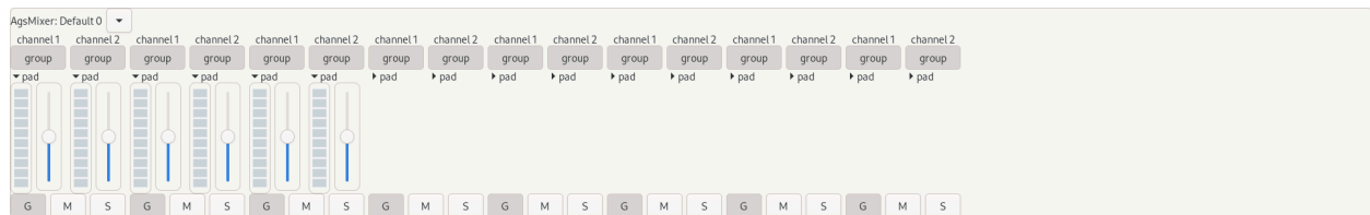
The mixer screenshot

Bundle audio lines with the mixer and perform toplevel stream manipulation. It contains per audio channel a volume indicator and may contain LADSPA or Lv2 plugins.